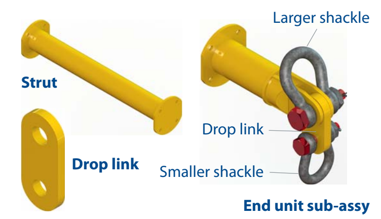
Table 1 – Component List